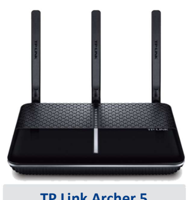
TP Link Archer 5